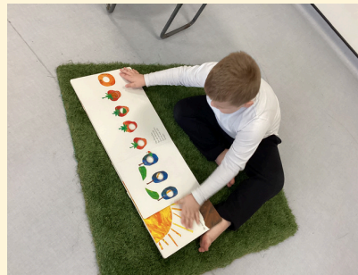
Reading the Very Hungry Caterpillar in Banyan class.