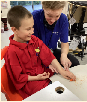
Clover class painting in the style of Canadian rolling art.