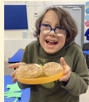
Making bread rolls in Oak class's maths lesson.